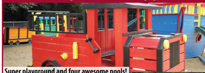
Super playground and four awesome pools!