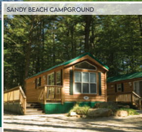
SANDY BEACH CAMPGROUND