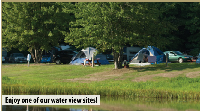
Enjoy one of our water view sites!

46 Old Stage Road, Madbury, NH 03823 • (603) 742-4050 info@oldstagecampground.com • www.oldstagecampground.com