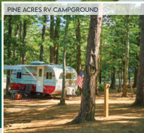
PINE ACRES RV CAMPGROUND