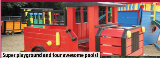
Super playground and four awesome pools!