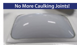
Unmatched Thickness - 187 Mils