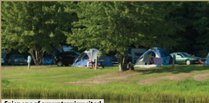
Enjoy one of our water view sites!

46 Old Stage Road, Madbury, NH 03823 • (603) 742-4050 info@oldstagecampground.com • www.oldstagecampground.com