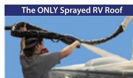
Custom Roof Lines